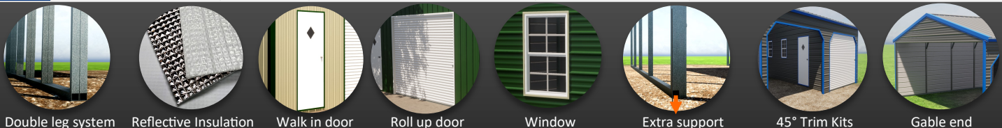
Double leg system Reflective Insulation Walk in door Roll up door Window Extra support 2' Under Ground 45° Trim Kits Gable end